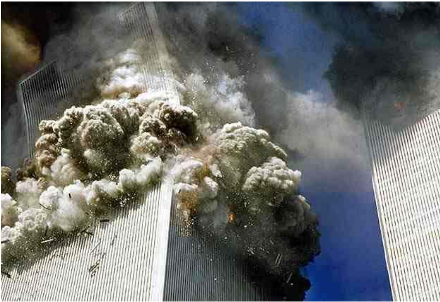
Topping power driver at start of obliteration sequence

Not only that but if one observed the actual collapse sequence the top portion did not crush the lower portion all the way down as Dr Seffen claims, rather there was no power driver available to crush the lower 80+ floors as the top portion was disintegrated first.